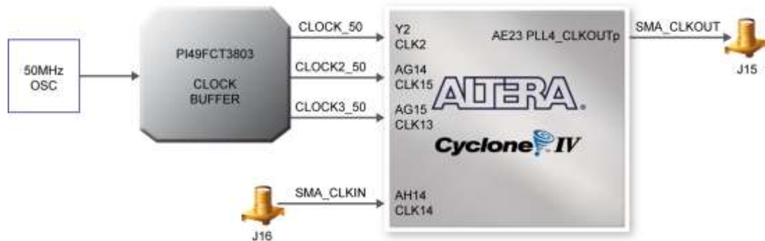
Figure 4-11 Block diagram of the clock distribution

The clock distribution on the DE2-115 board is shown in Figure 4-11 . The associated pin assignments for clock inputs to FPGA I/O pins are listed in Table 4-5 .